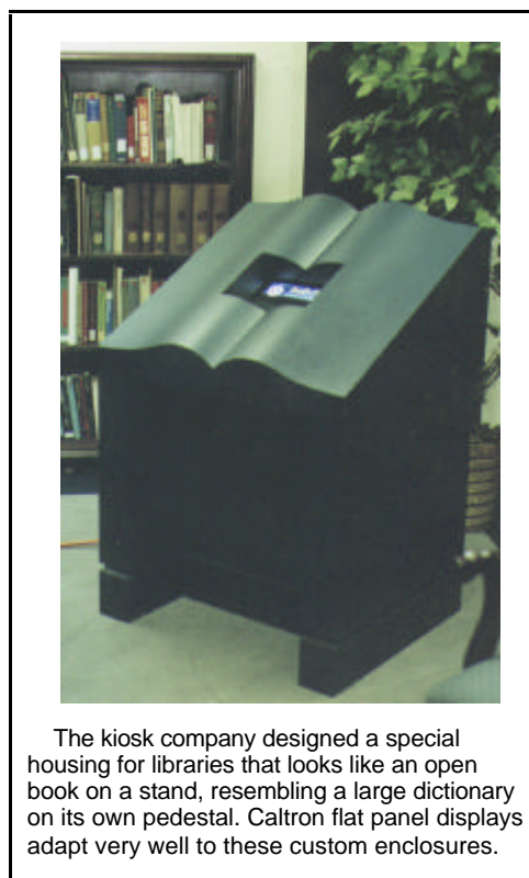
The kiosk company designed a special housing for libraries that looks like an open book on a stand, resembling a large dictionary on its own pedestal. Caltron flat panel displays adapt very well to these custom enclosures.

With some 300 installations around the country, the company does more than 50 installations a year, utilizing as many as 50 displays in each installation.